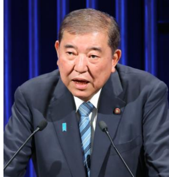
Guest of Honor Remarks: Shigeru Ishiba Former Prime Minister of Japan, Japan