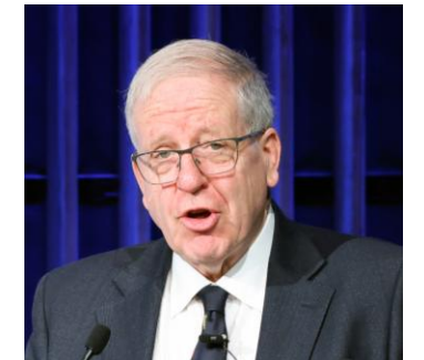
The Rt Hon. the Lord McLoughlin CH Former Secretary of State for Transport, UK