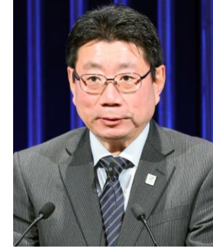
Guest of Honor Remarks: Yasushi Kaneko Minister of Land, Infrastructure, Transport and Tourism(MLIT), Japan (Read by Yoshimichi Terada, Vice- Minister for Transport, Tourism and International Affairs, MLIT)