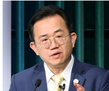
Pichet Kunadhamraks Director General, Department of Rail Transport, Ministry of Transport, Thailand