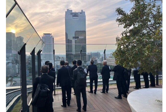
Development site of Umekita