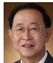
Arkhom TERMPITTAYAPASITH Former Finance Minister (Senior Advisory Board Member, IHRA)