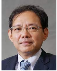
Atsushi Uehara Vice-Minister, Ministry of Land, Infrastructure and Transport