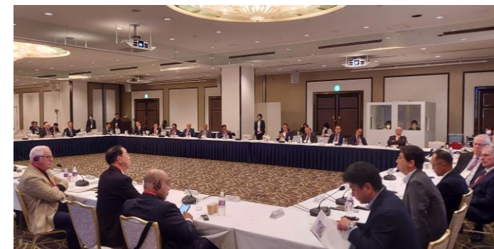
Oct 26 th Workshop Session 1