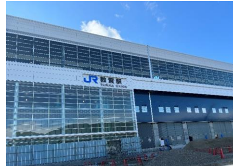
Exterior of Tsuruga Station