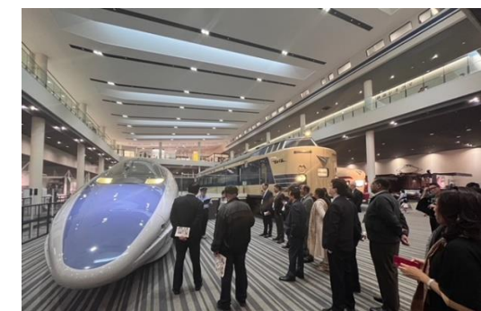
Kyoto Railway Museum