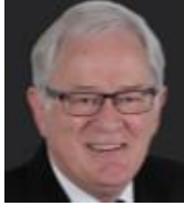
Andrew ROBB Former Minister, Trade and Investment (Senior Advisory Board Member, IHRA)