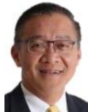
Chayatan PHROMSORNIN Permanent Secretary of Ministry of Transport