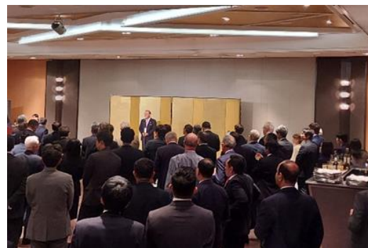
Oct 26 th Reception

Oct.27 th Plenary Meeting Technical Visits (Hokuriku-shinkansen’s new Tsuruga Station or Kyoto railway museum)