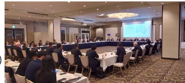
Oct 27 th Plenary Meeting