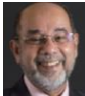
Syed Hamid ALBAR Former Chairman, SPAD (Senior Advisory Board Member, IHRA)