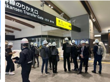
Inside of Tsuruga Station