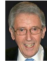
David Howell Former Energy and Transport Secretary (Senior Advisory Board Member, IHRA)