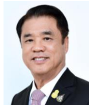
Suriya JUNGRUNGREANGKIT Minister of Transport